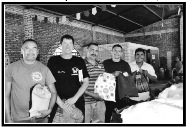
Thankful pastors receiving LLM bags